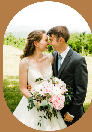
Dark and Moody