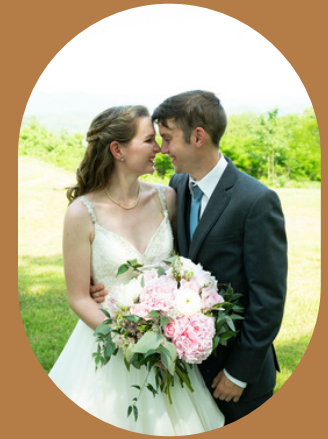
A La Natural