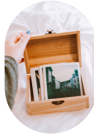
PRINTS IN LINEN BOX $200