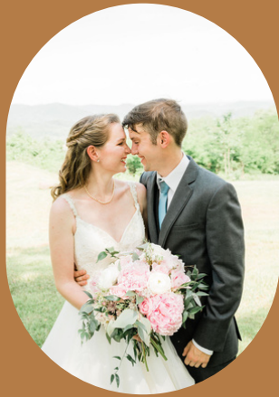
Light and Airy