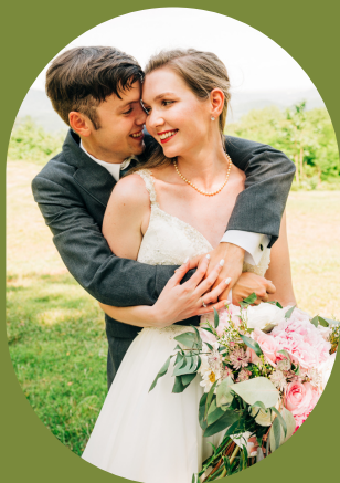
PACKAGE 1 $1,800