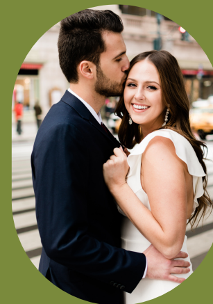
PACKAGE 3 $2,800