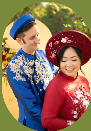
PACKAGE 2 $2,200