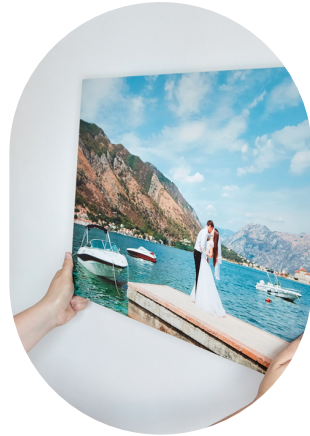
CANVAS PRINT $150-$225